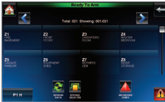
Zone List Screen