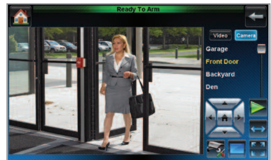
Camera Viewing Screen