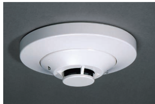
IDP-Photo (Base Not Included)